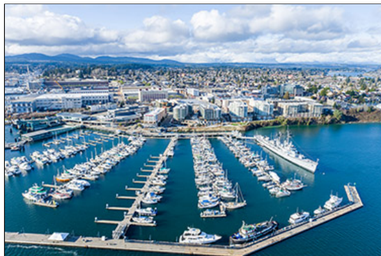
Marina Square overlooks Bremerton Marina and is within short walking distance to the Bremerton ferry terminal. [enlarge]

The project's two buildings are bifurcated by a public plaza.